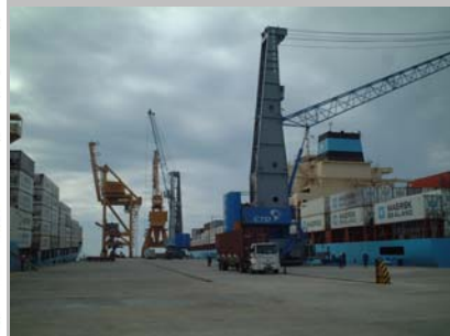
Pecém Industrial Port Development Master Plan